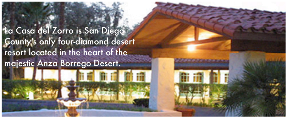
La Casa del Zorro is San Diego County's only four-diamond desert resort located in the heart of the majestic Anza Borrego Desert.